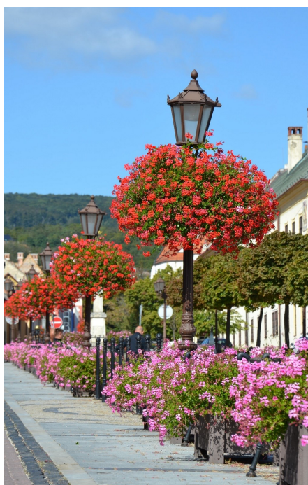
Self Watering Planter in Svaty Jur

After the inevitable cancellation of the 2020 competition, many Britain In Bloom groups are even more motivated to make 2021 a year to remember for all the right reasons. Our customers have worked hard to implement procedures to ensure strict adherence to Covid-secure practices, with many reporting that the self-watering feature of our planters is a significant help in ensuring social distancing and reducing unnecessary maintenance visits.