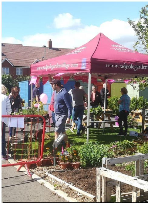
Our popular Open Plot events (prior to COVID restrictions)