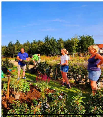
Community garden designed and installed for housing association flats in the village

Tadpole Garden Village (TGV) is a growing community development, located in North Wiltshire on the outskirts of Swindon, designed for a sustainable and healthy lifestyle. Comprising nearly 2,000 homes on completion, 60% of the village is dedicated open space for all residents to enjoy. The rear of the village opens out onto a 40 hectare nature park run by Wiltshire Wildlife Trust, providing woodland walks direct from the doorstep.