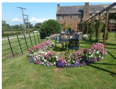
Blackmore Farm, Cannington

As well as interesting and original floral displays, general landscaping and general maintenance of grassed areas. They will also be looking at the environmental side of the business and community involvement.