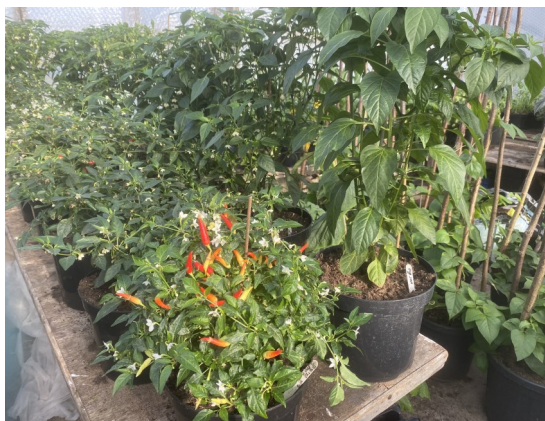
Some early Chilli Plants

It is our intention, Pandemic willing, to exhibit in the floral Pavillion at Chelsea this Autumn. The exhibit will test our skills in plant production, design and display.