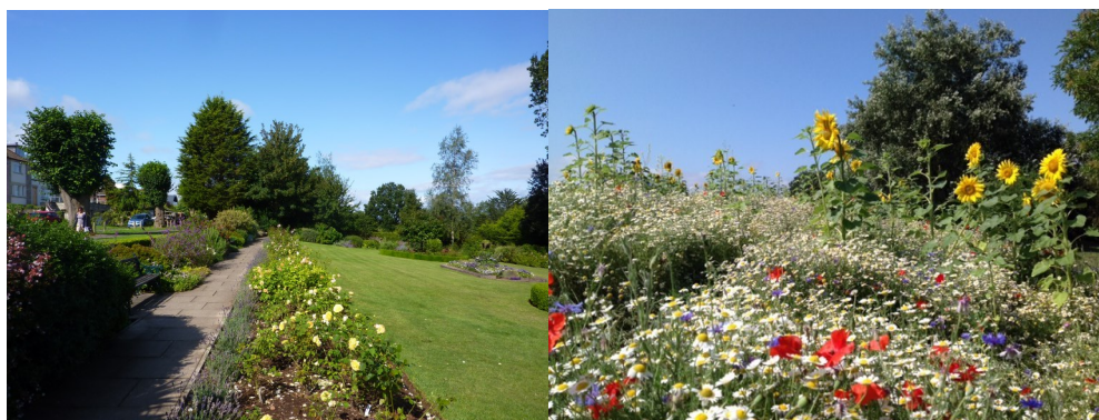
Rodmoor Gardens, Portishead

Entry forms are available from the Secretary or on our Web site.