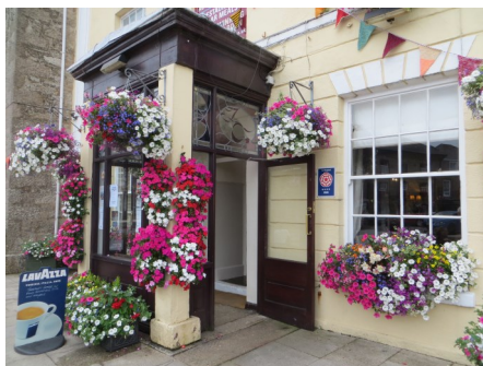
Commercial Inn St Just

Entries are already good in the Leisure, Tourism & Business awards for 2021. However many business's have had a very difficult year since the first lockdown in March 2020 especially those in the hospitality sector. With many only just being able to start trading again, entering our competition must have been far from their thoughts. Therefore we are keeping entry to this class open until the end May, and we would welcome any late entries who may wish to join our competition.