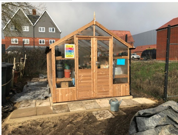
TGV in Bloom Community Greenhouse (funded by National Lottery)

Over the past 18 months, we have achieved a considerable amount, despite 12 months being under COVID restrictions, helped out by local businesses and village residents: