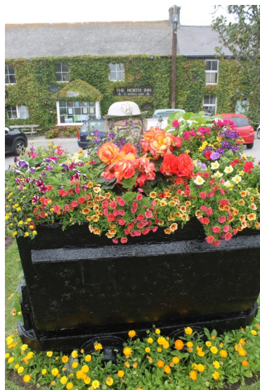
North Inn Penzance

The awards take on the traditional format of Gold, Silver Gilt, Silver and Bronze