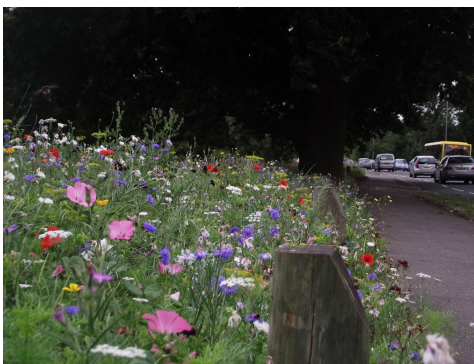
Bournemouth in 2013