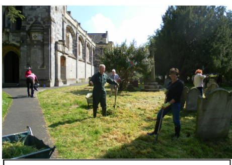
Volunteers in st David's Churchyard

EPW is now working hard through 2014 to attract many more individual 'It's Your Neighbourhood' entries and, more specifically, to achieve more 'Village' entries. This is a particularly attractive category. It enables community groups to enter a number of their green spaces without being constrained by artificial boundaries i.e. ward boundaries or lines on a map. The 'village' is the cluster of green