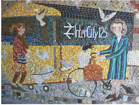
Small City Class Exeter