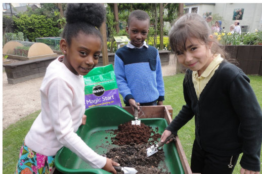
Charlton Manor School mixing Compost

The Scotts Miracle-Gro Company is Britain's biggest producer of garden care products and composts. As part of their outreach programme they encourage schools to use horticulture in class and garden clubs to stimulate interest in gardening. Each year at least 100 schools from around the country grow selected plants to discover the science of plant growth and the benefits of home grown, seasonal food.