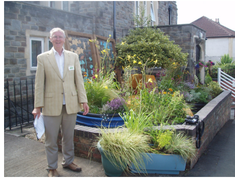
Urban Community St George in Bloom, Bristol