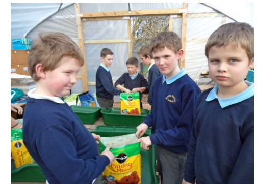
Starting sowing carrots

Miracle Growers also have a Facebook page where you can keep up to date with this year's progress and post your own pictures and stories.