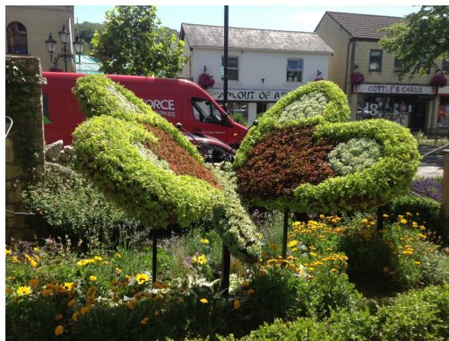
Small Town Midsomer Norton

railings, tiered planters, hanging baskets and ‘up the pole’ style containers brighten up uninspiring areas and enable plants to grow in places other than at street level where space may be at a premium. It’s also easier to create optimal growing conditions, controlling soil type and environment.