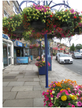
Large Town Portishead