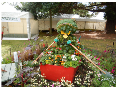
Blackmore Gardens & Sports field

The announcement and presentation of the awards will be made at the Spring Seminar to be held at Exeter University on Thursday 25th February.