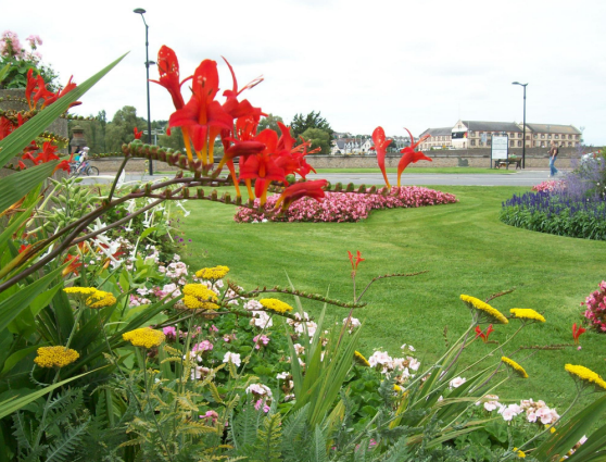
Barnstable Floral Displays

We pride ourselves on the professionalism and precision of every aspect of our duties and work tirelessly to put the people we employ and the people we work with, first.