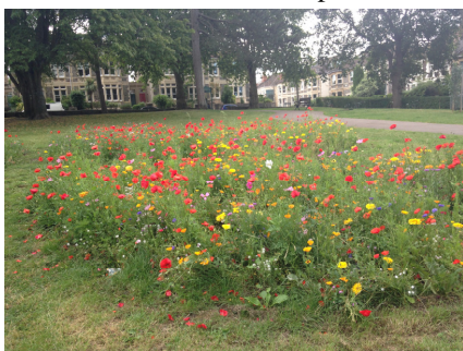
St Andrews Park