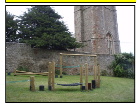
Bath Gold Medalist and Winner in the TescoCup 2010. National Small City entry for 2011