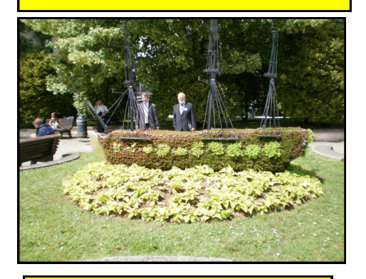
Thornbury - Gold Medalist & Winner of the Sargent Cup in 2010 National small town entry for 2011