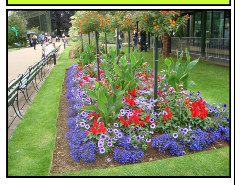
Plymouth Gold Medalist in the South West Tourism Cup 2010 National entry in Large Coastal 2011