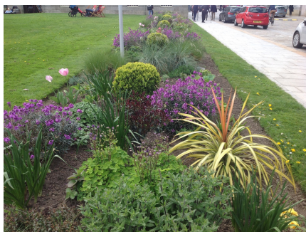
Plymouth Royal William Yard GOLD

Judges will be looking at areas around entrances, public facilities, signage, standard of maintenance and general appearance. As well as interesting and original floral displays, general landscaping and general maintenance of grassed areas.