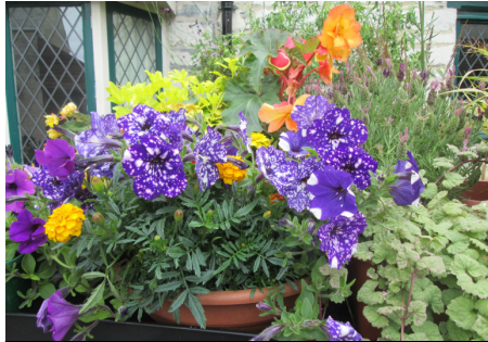
Curry Rival High Street

Britain in Bloom is nowadays of course, much more than the name implies and 'It's Your Neighbourhood' goes from strength to strength in the West country region. However, there is no doubt that the stunning floral displays so characteristic of the competition are really something to look forward to as we 'stumble' into our West Country summer! It has been a difficult start to the season and already groups around the region have