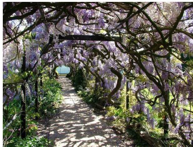
Pinces Gardens, Exeter – The Wisteria Arch

It has become a platform for a variety of outdoor activities which has brought people of all ages and abilities together in a way which few if any other initiatives can. But the impact on our urban Neighbourhoods which are now greener and cleaner can't be under-estimated. Of course there is more to be done. But it is worth taking time out to look back and see how far communities have come and celebrating that success.