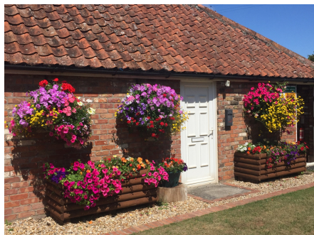
Burnham on Sea Salt Express Ltd GOLD

They will also be looking at the environmental side of the business and community involvement. The awards take on the traditional format of Gold, Silver Gilt, Silver and Bronze