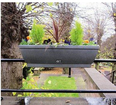
Self watering Barrier Basket

Offer choice - Ideally you should create a specific sponsorship structure to ensure consistency. You could offer different levels of sponsorship such as Gold, Silver and Bronze packages to involve organisations of different sizes which may have varying budgets available.