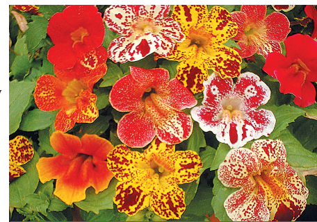
Mimulus Super Hybrids

Calendula Kinglet Mix – a brand new introduction producing 'anemone' like crested flowers in all the popular calendula colours. Ht. 45cms (18") Impatiens (Busy Lizzie) Tumbler Trailing Mix – at last a trailing Impatiens for hanging baskets and tubs. Quick to grow and flower. Will trail some 25-40cms (10-15") A/F Marigold F1 Zenith Mix – a cross between African and French types that you never need to 'dead head?' To good to be true? This triploid type never produces seed. Consequently, as part of the natural life cycle, plants continue to try and therefore constantly produce new flowers, covering the faded ones right through to the autumn. Mimulus – the delightful 'Monkey' flower, will bloom in just 6 weeks from sowing, so it's a great choice for starting in late May/early June to rejuvenate any tired areas in hanging baskets and other containers.