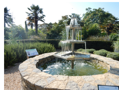
Cannington Walled Garden

Following the success of the Parks award, it will continue in 2017, with judging again being any time from June to December. This allows for the park to be judged at "Its Best". Closing date for entries Monday June 12th. As before the presentation for the 2016 awards will be held as part of the Spring Seminar in Torquay on 2nd March 2017.