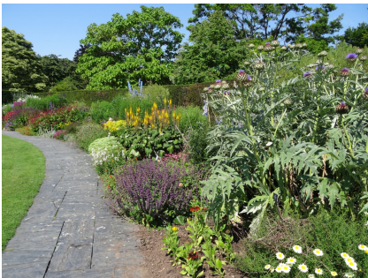
Urban Community Clifton, Bristol