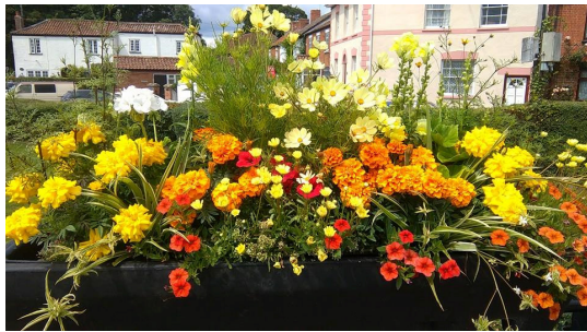
Village Class Cannington