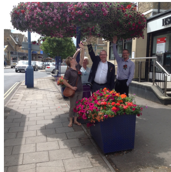
Champion of Champions Portishead