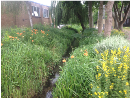
Small Town Sherborne