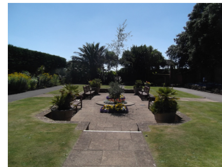
Sidmouth, Connaught Gardens