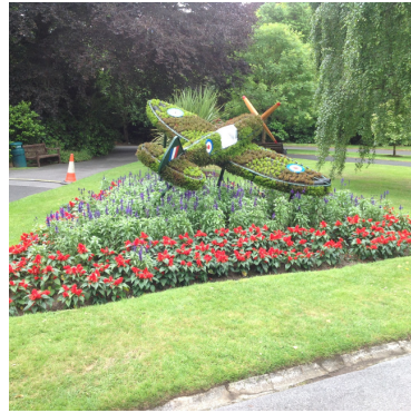
Large Town Truro