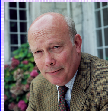
Lord Julian Fellowes