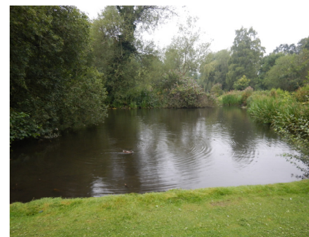
Yeovil Country Park