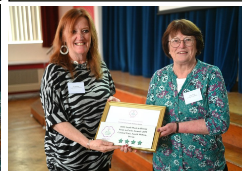
Central Park, South Molton 4 Star