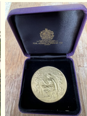
The Lawrence Medal