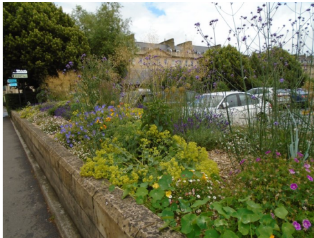
Bath Small City