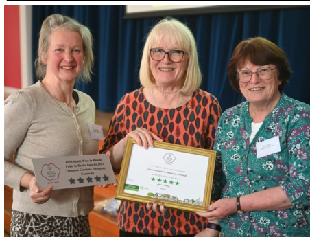
Trennace Gardens 5 Star