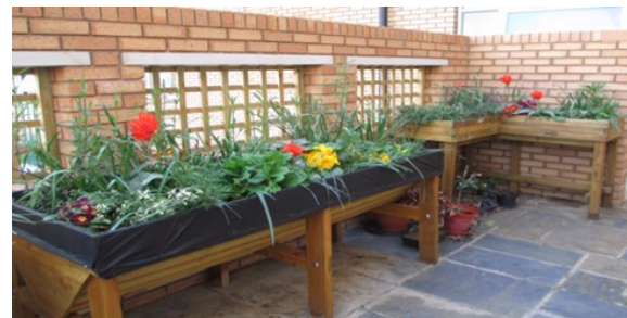
Suttons V-shaped trough and corner planters

At the Royal Hospital for Neuro-disability in London, raised wooden units are used for growing. Participation with Thrive in a design project with Forest Garden led to the purchase of the corner planters below. These are very good for stroke patients who can garden with one hand but need encouragement to use the other hand.