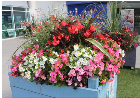
St Austell Bid