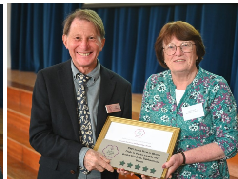
Tessier Gardens, 5 Star