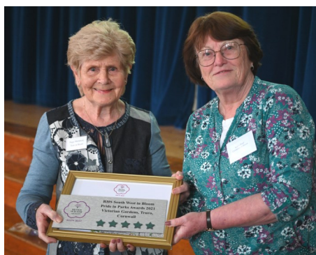
Victoria Gardens, Truro 5 Star