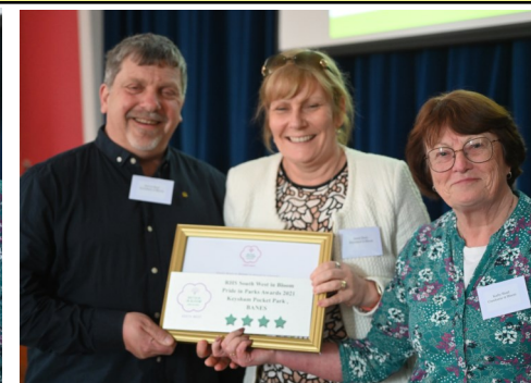
Keynsham Pocket Park 4 Star