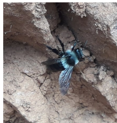
Ashy mining bee on Troopers

"Regarding the bees, it is good of them to contact you. I would think that so long as the hive isn't right on the edge of the reserve it's unlikely to have any effect on the reserve's bees - as you say honey bees are a common sight there anyway. It might be worth encouraging them to provide a good range of nectar plants close to the hive to reduce the likelihood of them relying too heavily on the LNR (Local Nature Reserve)."