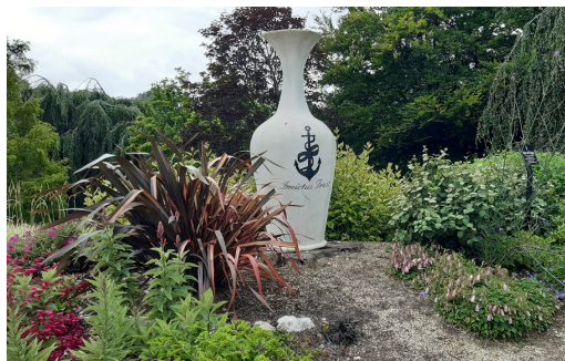
Victoria Gardens, Truro