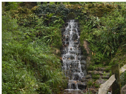
Yeovil Country Park

The path has also made it easier to vary the grass-cutting regime on the Field using the path as a boundary marker dividing areas into “rural cut” (once a year to allow growth of wildflowers) and “recreational turf” (more frequent cutting) to allow the easy use of the larger areas for games, picnics and other leisure purposes. As a result there are now more areas of long grass, which provides a greater range of wildlife habitats and the human visitors do not feel they have lost any of “their” space.