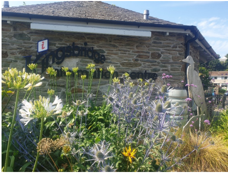
Kingsbridge Small Town