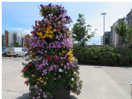
Portishead Large Town