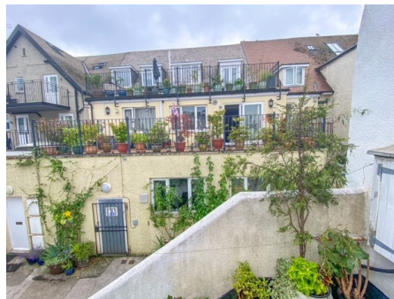
Dartmouth Foss Slip Garden Outstanding