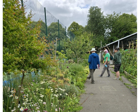
Gordon Ford Trophy, Runner Up Redcatch Community Garden