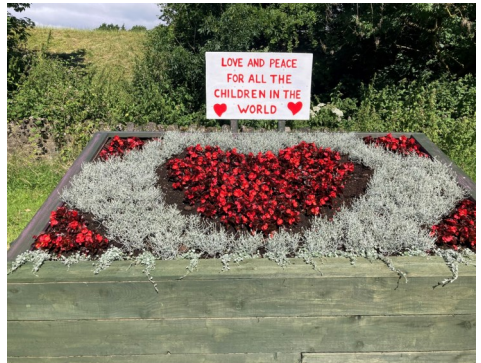
Winner Over 10K Population: Thornbury in Bloom