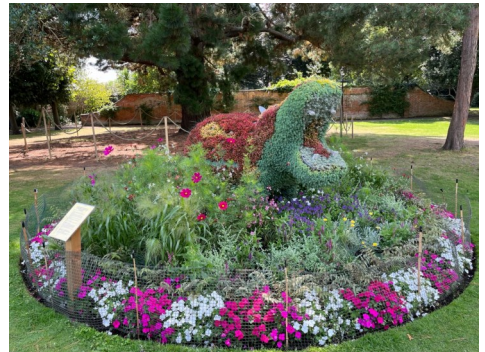
Sargent Cup Sidmouth in Bloom