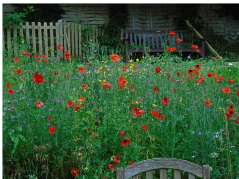
Tiverton Blundell School Outstanding