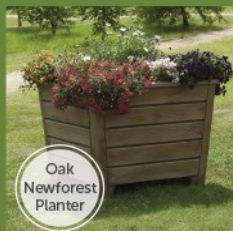
Oak Newforest Planter