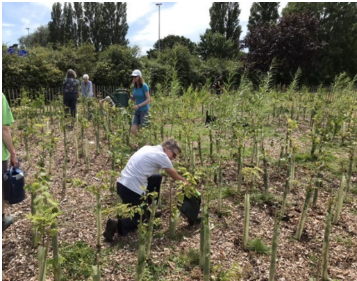
Winner, Tiny Forest, Exmouth