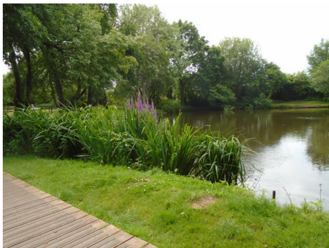
Wellington Basins Outstanding