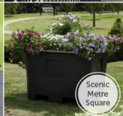
Scenic Metre Square