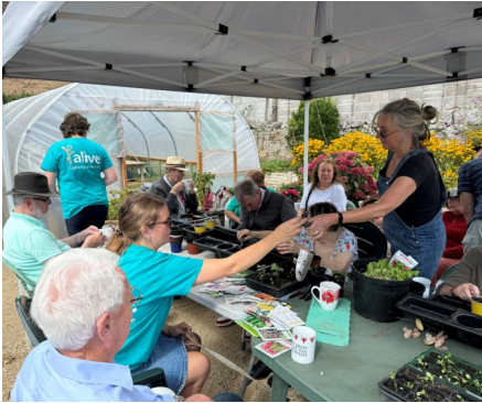
Gordon Ford Trophy, Best IYN Winner Stanleys Garden. W-s-M