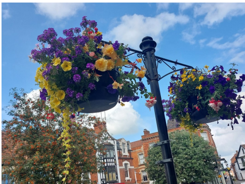
Winner Under 10K Population: Glastonbury in Bloom