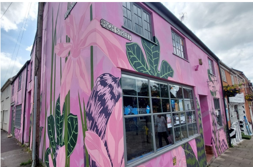
Exceptional Public Engagement Arts & Leisure Winner GLASTONBURY