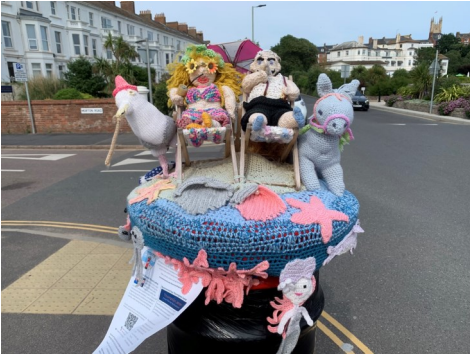
Sponsors Trophy, Best Entry: Exmouth