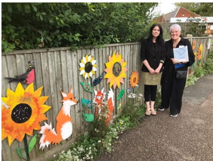
Exmouth, Over the Garden Fence Outstanding