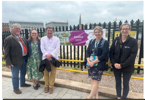
BID: InExeter SILVER GILT BID GROUP WINNER