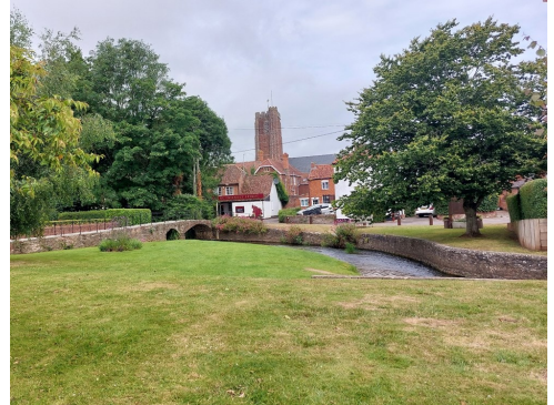
Large Village: Cannington GOLD