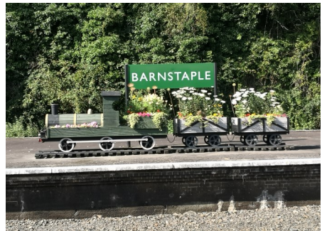
Barnstaple Railway Station Outstanding