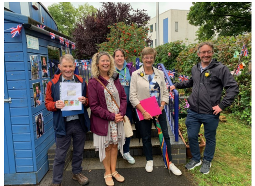
Portishead Youth Centre Outstanding