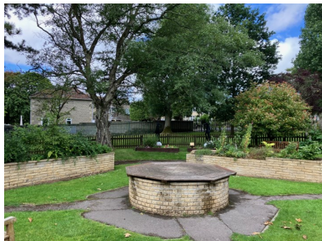
John Coles Park, Chippenham

We are again pleased with the response for the 2024 Pride in Parks Awards. The parks judging is from June and will finish at the end of the year. This allows the parks to decide on the best time of the year they prefer to be judged. As in previous years, the Presentation for the 2024 Parks Awards will be held during the Spring Seminar, next year to be held at Rosemoor on the 27th March. Pride in Parks 2025 entry forms will be sent with the Spring Newsletter, with the closing date for receipt of entries being set for Monday 9th June 2025 .