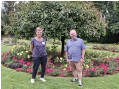
Rodmoor Gardens, Portishead