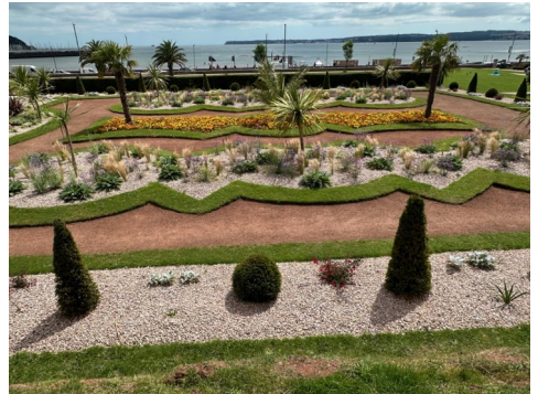
Abbiss Cup, Best Horticultural Display Municipal: Torquay