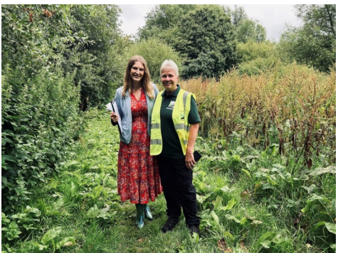
Join 3rd Conigre Nature Reserve, Melksham