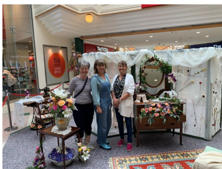
Barnstaple, Floral Art Club Outstanding