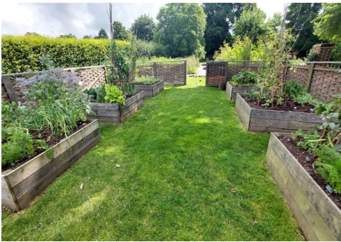
Small Town: Glastonbury GOLD