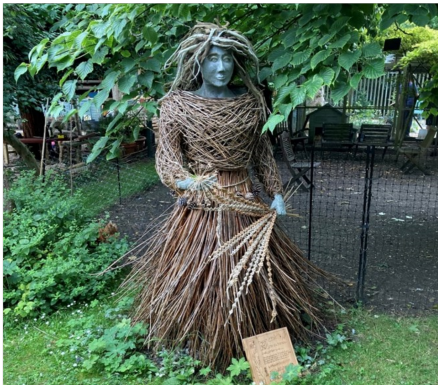
Gordon Ford Trophy, Third Place .Twigs community Garden