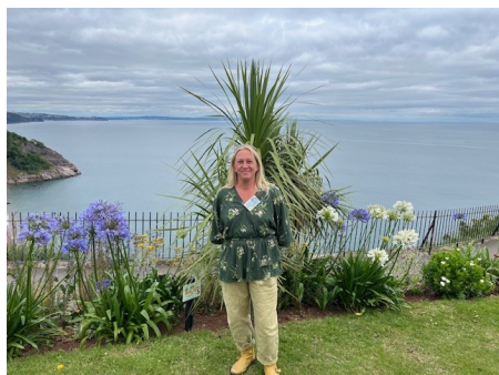
Babbacombe Downs Buglife Bed Outstanding