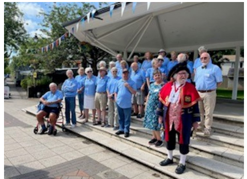
Sargent Trophy, Outstanding Effort & Contribution: Kingsbridge in Bloom