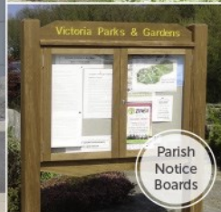
Parish Notice Boards