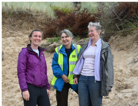
Newquay, Fistral Beach Clean, Outstanding