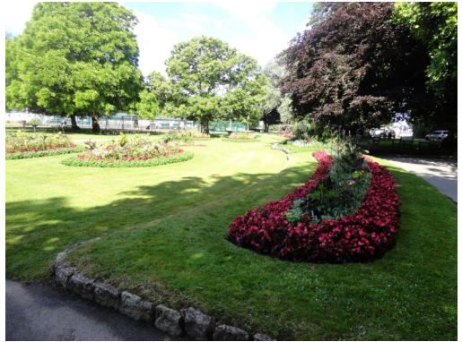
Portman Cup Truro in Bloom

Entry Closing Date For The 2025 South West In Bloom Competition Saturday 1st March