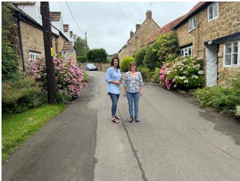
Viv Verrier Trophy, Best New Entry: Barrington in Bloom