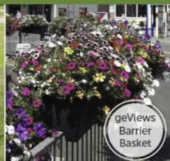
geViews Barrier Basket