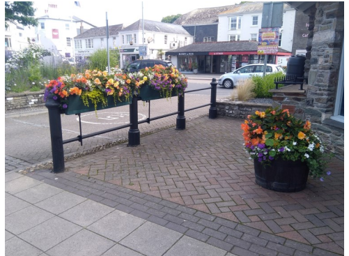
SWTA Cup Kingsbridge in Bloom