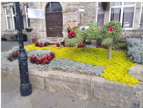
Preece Cup Hayle in Bloom