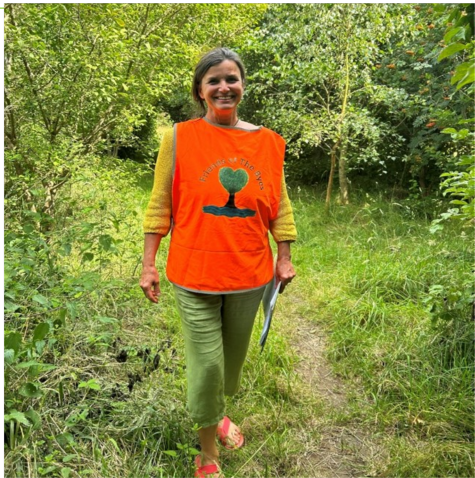
Runner Up, Sidmouth, Friend of the Bys