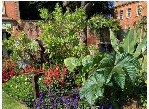
Town: Yeovil SILVER GILT